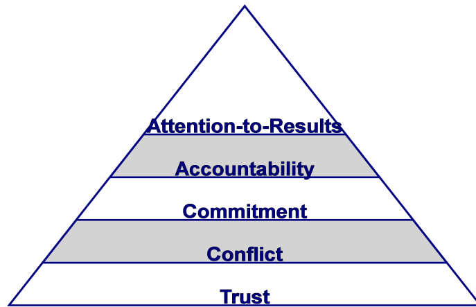
Figure 1: The five functions of a team